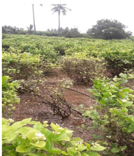
Fig.1 Untreated field view