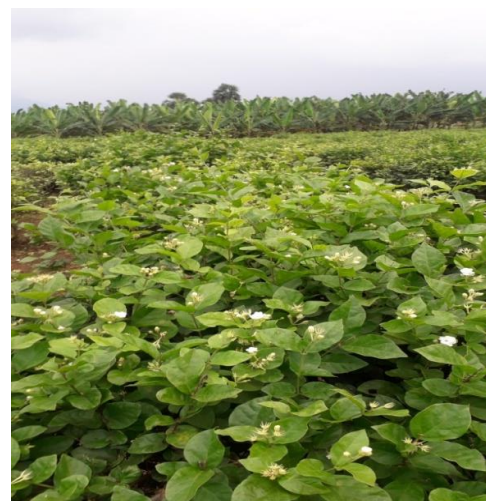
Treated field View

1.48 respectively). Similar findings were reported by Arunasri et al. (2021) who reported in ground nut stem rot caused by S.rolfsii . Among eight combination fungicides screened for efficacy on viability of sclerotia of S.rolfsii , Hexaconazole+Zineb (Avtar) has inhibited the germination of sclerotia to the maximum extent of inhibition (98.88%). At 5 cm and 10 cm depths all the fungicides Azoxystrobin 11%+ Tebuconazole 18.3 %SC; Azoxystrobin 7.1%+ Propiconazole 11.9% SE; Azoxystrobin 18.2% +Difenoconazole 11.4 %SC; Tebuconazole 50% + Trifloxystrobin 25% WG.; Mancozeb 63% + Carbendazim 12%WP; Flusilazole