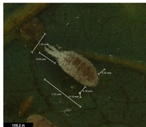
Fig. 1 Ferrisia virgata (Cockerell)

The collection and identification of mealybug species in cassava registered the presence F. virgata , P. jackbeardsleyi and P. manihoti in cassava.