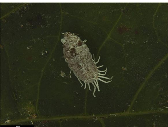
Fig. 2. Pseudococcus jackbeardsleyi Gimpel