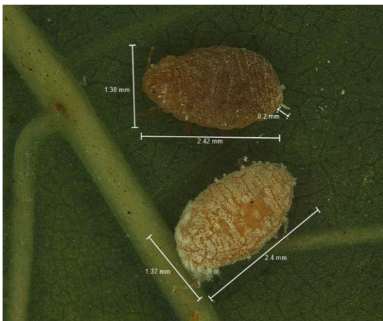
Fig. 3. Phenacoccus manihoti Matile-Ferrero