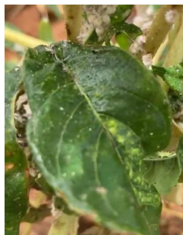
Fig. 4. Symptom of damage by P. manihoti