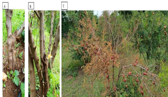
Fig. 3) Bacterial wilt symptoms A) vertical stem cracking B) bark splitting C) yellowing and drooping of leaves

Effective management of this disease can be achieved through integrated practices that involve maintaining good sanitation, considering resistant cultivars, adopting cultural methods, biological methods and chemical control measures. Apply promising bio formulations such as Aspergillus niger AN27 @ 1kg/acre and mycorrhiza Rhizophagus irregularis Syn. Glomus irregularis @ 1-5Kg/acre), Trichoderma harzianum , Pseudomonas spp. etc., at six months interval right from the planting. These serve as the best preventive measure for all types of wilt pathogens. Grow green manure crops like daincha ( Sesbania aculeata ) and sun hemp ( Crotalaria juncea ) during the rainy season and incorporate them into the soil before flowering. Apply boron depending on soil test value. The wounds caused by root-knot nematodes (RKN) can be prevented by application of Paecilomyces lilacinus @4-5Kg/acre (Sharma et al. , 2010). Application of carbendazim @ 2g/l along with @ Chlorpyrifos 2ml/l can be taken-up (Pal et al. , 2014).