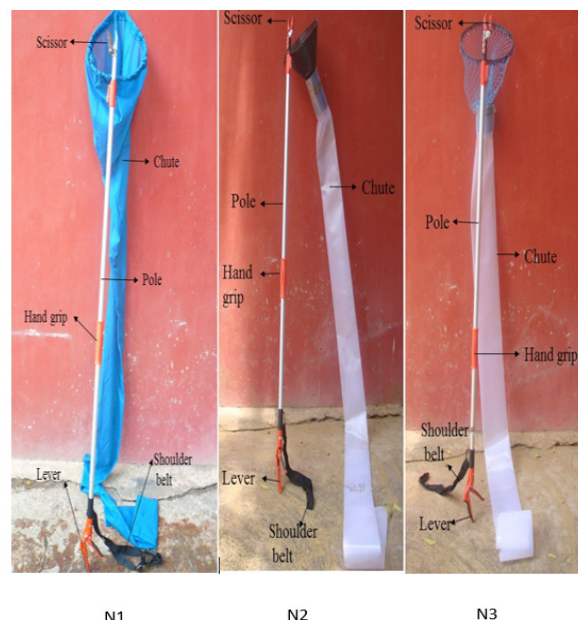
Figure 2. Ergo refined fruit harvester