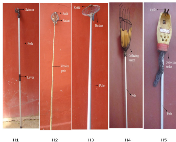
Figure 1. Different conventional fruit harvester

21%, 9.4%, and 12%, respectively. According to ΔHR result, it was observed that the ergo refined fruit harvesters N 1 , N 2 , and N 3 showed a reduction of 25%, 12%, and 14%. In the case of ODR, it was 11%, 15%, and 17% respectively (Figure 4 & 5). The BPDS score also indicated a 12% to 23% reduction from the conventional type fruit harvesters. The above result confirmed that the N1 model fruit harvester performed better than others.