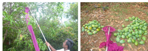
Figure 3. Ergo refined fruit harvesters were evaluated in the field