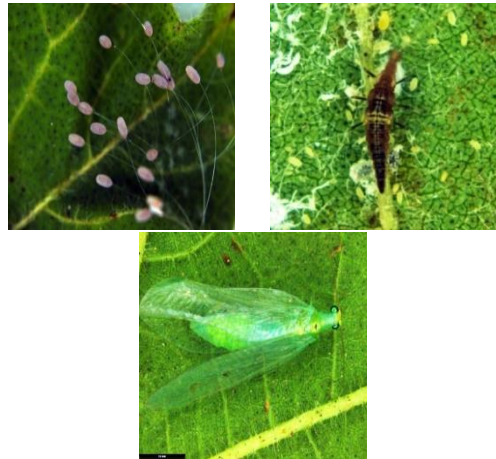
Figure 4 (a-c) Life cycle of Chrysoperla carnea (a) Egg (b) Grub (c) Adult

1. Body cylindrical, integument smooth, with the exception of a thin terminal segment, head with elongated antenna, short styliform mandible, spatula absent, six dorsal papillae with long setae present on all thoracic and abdominal segments..... Diadiplosis sp (Fig 5 a-b)