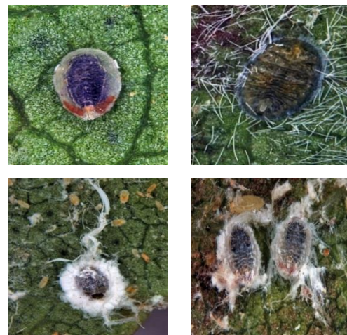
Figure 1 (a-d). Parasitized whitefly pupae on cotton leaves (a) Bemisia tabaci parasitized by Encarsia sp (b) Parasitized Paraleyrodes bondari pupa (c) Encarsia sp emerged from Aleurodicus dispersus pupa (d) Parasitized Aleurodicus rugioperculatus pupae

the whitefly puparium is transparent yellow in colour. But parasitized whitefly pupae are identified by their blackish brown colour with a circular exit hole on the last abdominal segments of the whitefly complex, viz., B. tabaci , A. dispersus , A. rugioperculatus and P. bondari (Fig 1 a-d). The most commonly found parasitoids are E. guadeloupae and E. dispersa (Hymenoptera: Aphelinidae). Key characteristics of female E. guadeloupae are as follows: except for the mesoscutum and scutellum side lobes, the body is dark brown; the midlobe is mostly dark brown. The hind coxa and femur are dark brown in colour and the rest of the legs are light yellow to white. The forewing and the hind wings are hyaline in nature (Selvaraj et al., 2016). The coccinellid predator named as C. sexmaculata was commonly found in all cultivated crops except some crops was observed. It has been recorded feeding on B.tabaci on the cotton ecosystem (Kapadia and Puri, 1992). Rao et al. (1989) in Andhra Pradesh reported that B. tabaci was predated by C. sexmaculata and Chrysoperla carnea were observed in pulses. Cybocephalus sp and Diadiplosis sp. were the most abundant and active predators (Ramani et al., 2002).