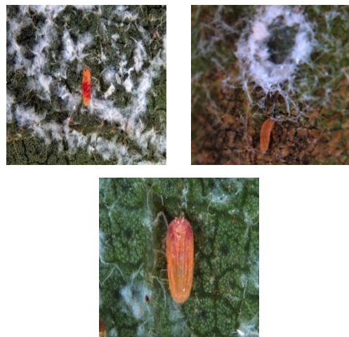
Figure 5 (a-b) Life cycle of Diadiplosis sp. (a) Larva (b) Larva feeding on eggs (c) Pupa