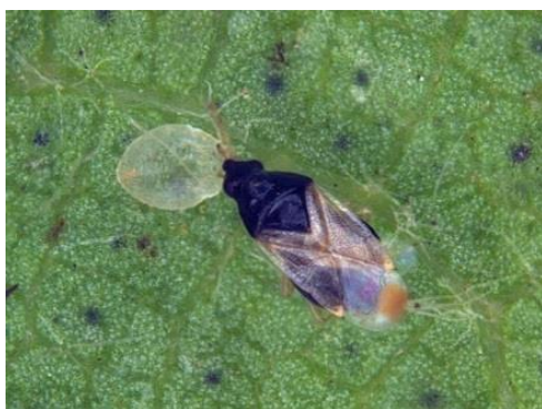
Figure 7 (a) Orius insidiosus feeding on whitefly pupa