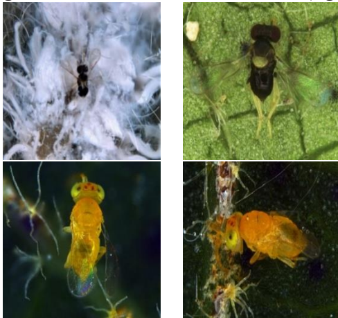
Figure 2 (a-d) Adult stages of E. guadeloupeae and E. dispersa

1. Six-spotted zigzag marking on elytra, 3mm in body length, yellow to canary yellow body colour, convexed body, larvae have a mandibulo-suctorial mouth parts and urogomphi present in larvae's last abdominal segment..... Cheilomenes sexmaculata (Fig 3 a-c)