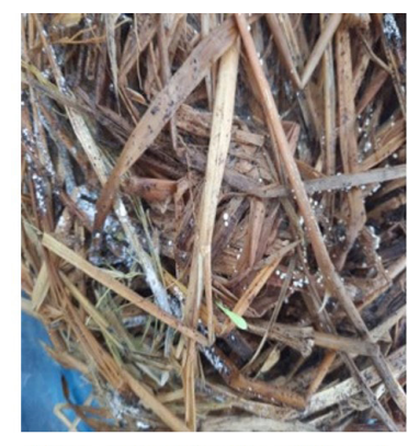
Fig. 2. Outdoor cultivation of V.volvacea under different cropping systems

relative humidity. In our study, the V.volvacea strain Vv-19-06 produced good chlamydospore formation in spawn and produced sporophores with sturdy buttons and prolonged morphogenesis without deterioration during the cropping period that offers scope for outdoor cultivation.