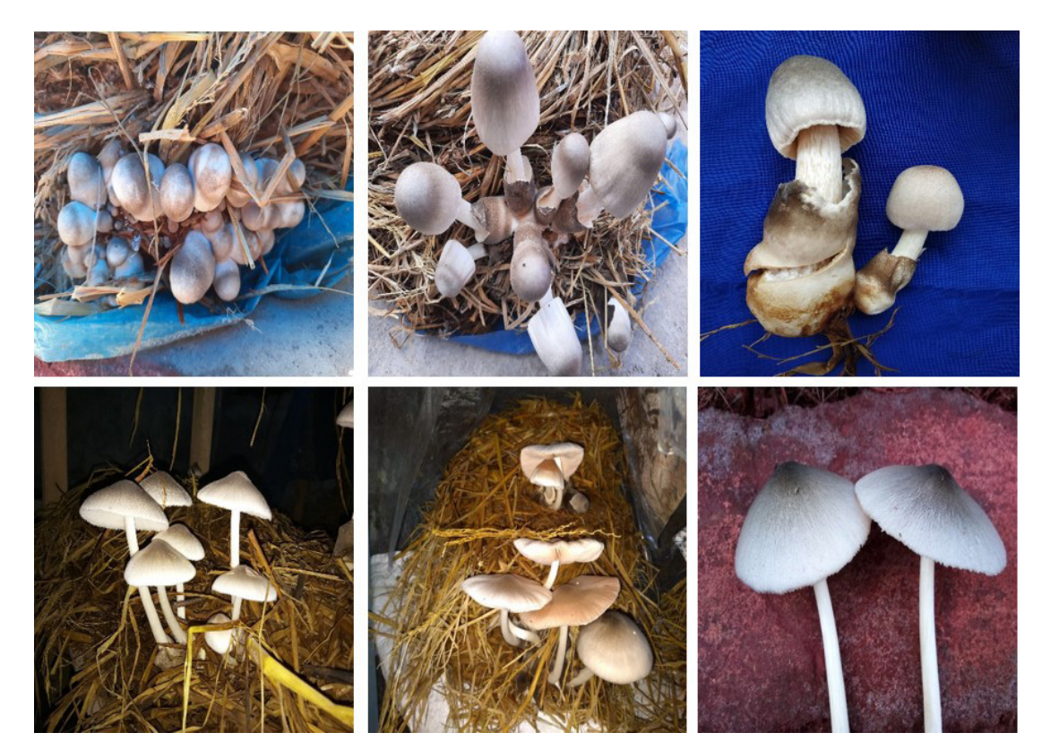
Figure 1. Selected strain Vv-19-06 of Paddy straw mushroom, V.volvacea

pinheads/primordia emerged early in Vv-19-01 on 9<sup>th</sup> day followed by PS1,Vv-19-03 and Vv-19-06 when compared to other strains (13.9 to 14.5 days). Similarly, the strains Vv-19-01, Vv-19-03 and PS1 produced sporophores at egg/button stage ready for harvest within 11 to 11.5 days whereas Vv-19-06 took 12 days; however, they were on par with each other. However, the average fruit body weight was maximum in Vv-19-06 and Vv-19-03 and PS1 (35.98g,36.22g,33.08g, respectively).The average number of fruiting bodies/ bed was maximum in PS1 (32 numbers) and Vv-19-06 (31.5 numbers). Significantly superior biological efficiency of 17.44 % in Vv-19-06 followed by PS1 (16.2 %) was recorded.