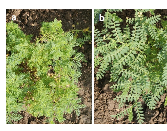
Figure 1. Symptoms of phytoplasma on chickpea with stunting and bushy appearance of infected plants (a)and healthy plants (b) under field cultivation.

was centrifuged at 10000 rpm for 10 min at 4°C. The supernatant was collected in a new eppendorf tubes and added with ice-cold isopropanol to separe the DNA from the drawn aqueous phase and then incubated on ice for 1 h.The DNA pellet was gained through centrifugation at 10000 rpm for 10 min and then purified using 3 M sodium acetete. The purified pellet was washed with 80 % ethanol, finally resuspended in 35 \mu L of TE buffer and purity of isolated DNA was analysed through 0.8 % agarose gel electrophoresis.