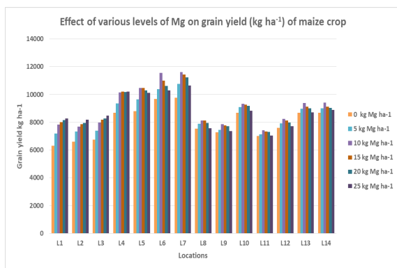
Figure 1. Effect of various levels of Mg on grain yield (kg ha -1 ) of maize crop.

L 11 . In the control plot, the overall values ranged from 6311 to 9750 kg ha -1 across the locations. Crop growth and grain yield were positively correlated with intending at nutrients to the soil. The grain and straw yield of maize crops were significantly increased by the application of Mg fertilizer. The increased yield registered in this field study could be attributed to the effect of Mg on plant growth especially enhanced enzymatic activity. The Mg fertilization improved the synthesis and transport of carbohydrate to grains. The application of Mg established better source link relationship, thus influenced the grain yield. Similar findings were also found in the experiments conducted by Ramanjineyulu et al. , 2018, El-Dissoky et al. (2017) and Jan Bocianowski et al. (2015).